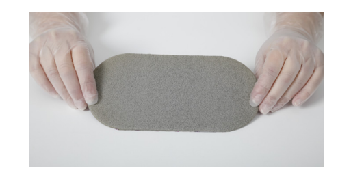
1. Use Mepilex Ag 10x20cm.

For this application, you will need one Mepilex® Ag 10x20cm dressing.