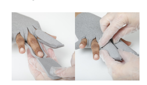
7. Apply one part of the dressing to the finger and fold it back using the newly created small triangles.