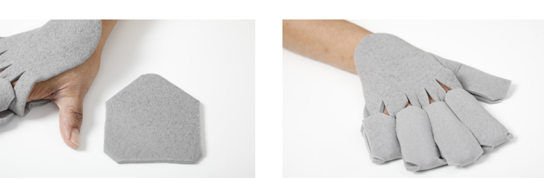
10. Cut another of the remaining round 11. Roll the dressing around the thumb to cover it.