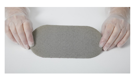
1. Use Mepilex Ag 10x20cm.