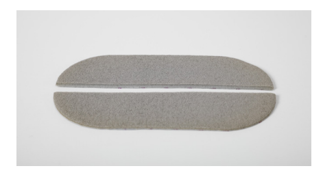
2. Cut the dressing lengthwise from end to end.